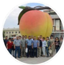
Figure 1. Activities of the Central Asian Working Group